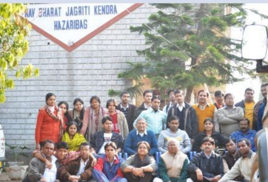
Rural immersion : Students on field-trip

Students have visited various organisations along with programme such as Nav Bharat Jagriti Kendra, Jharkhand and other organisations.