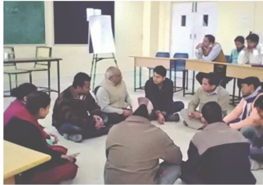
Following a new Pedagogy in class room teaching (Simulation of PRA)

students would spend some time in the field to get exposed to the realities and immerse in the rural and urban situations. This is crucial part of the pedagogy which helps the students internalize some of the essential nuances and strategize into action to deal with them,